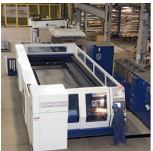
Tolerances to your needs... to your specifications