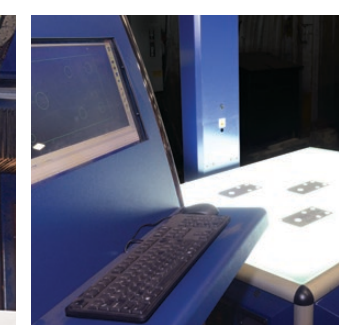
Inspecvision Planar provides inspection and reverse engineering of flat parts