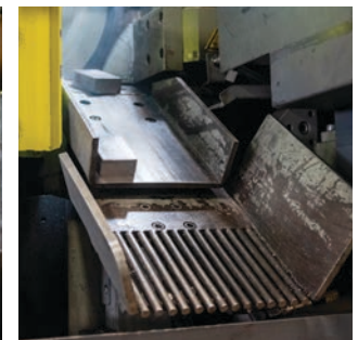
Automatic, hydraulic discharge chute sorts finished pieces