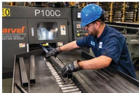
Continuous feeding of bar and tube stock possible with automated loading table