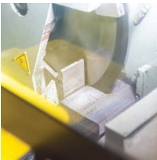
Ultra thin carbide blades minimize kerf loss and material waste